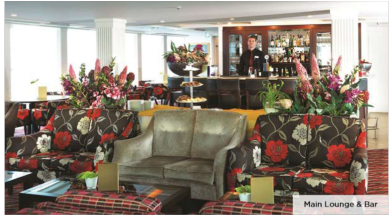
Main Lounge & Bar